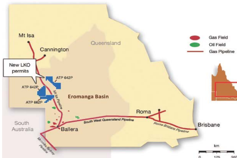
Lakes Oil’s Queensland Permits