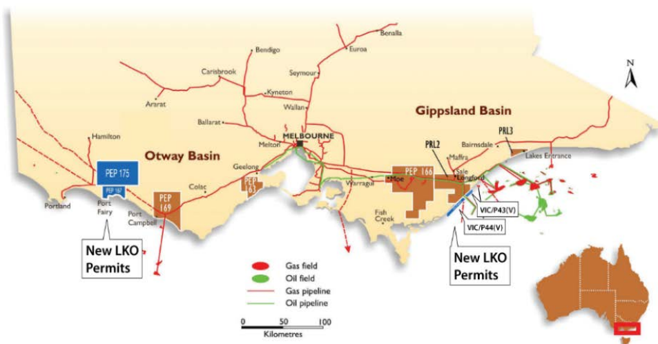
Lakes Oil's Victorian Permits