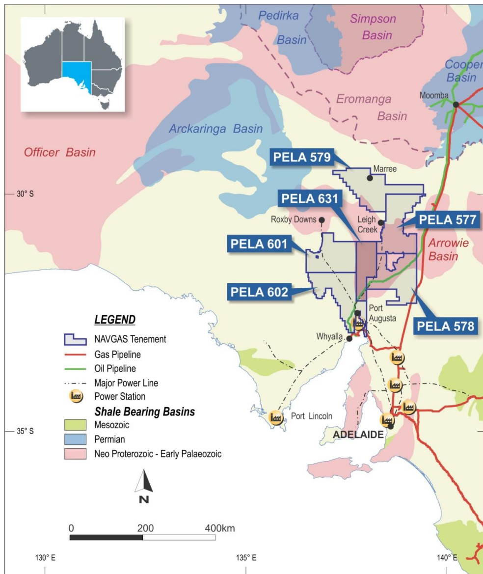
Figure 2: Pirie Torrens Project area in South Australia held by Lakes Oil.

The Pirie Torrens oil & gas project incorporates six (6) PELA's (Petroleum Exploration Licence Applications) covering approximately 53,000km 2 in South Australia, as illustrated in Figure 2. The project is 100% owned by Lakes Oil through its subsidiary, Navgas.